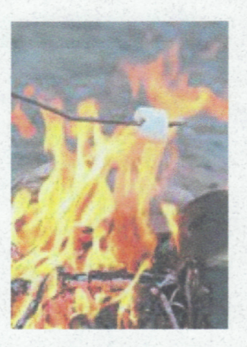
202XN Rod used to roast marshmallows.

If you have any questions regarding any of our other specialty products, please contact myself or anybody else from the ZL team to assist you.